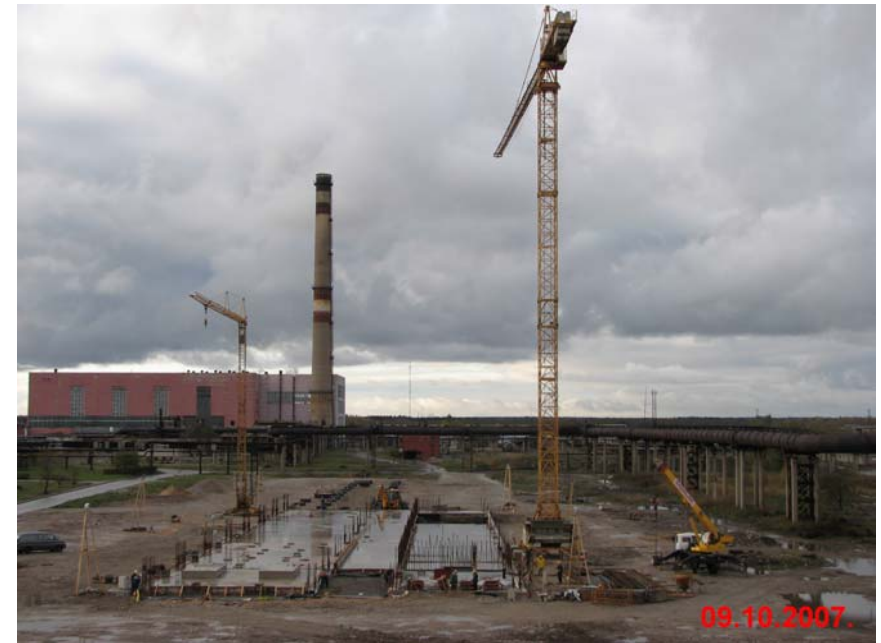
Foundation of UTT-3000 on Viru Keemia Group Galoter Project Site in Kohtla Yarve, Estonia, made under ATOMENERGOPROEKT's design, 9 th Oct, 2007