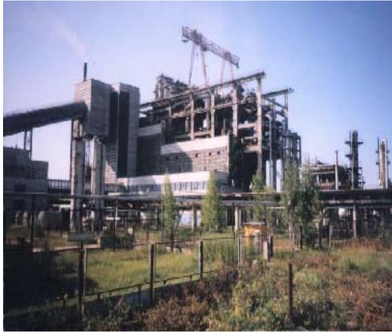
Oil Factory in Narva, Estonia, built under ATOMENERGOPROEKT's design, 1980-84